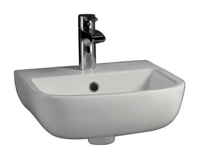
Faucet not included